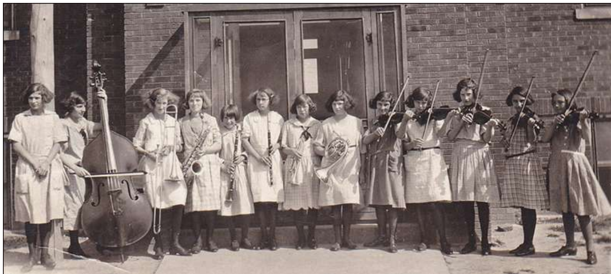
1920 Girls' Band from Orphanage