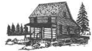
Ratcliff Inn 218 E. Main Street