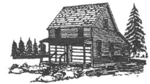
Ratcliff Inn 218 E. Main Street